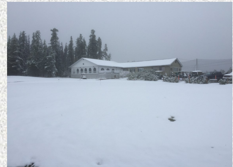
3" of snow blanketed the golf course Sunday morning after the tournament. We were very lucky!