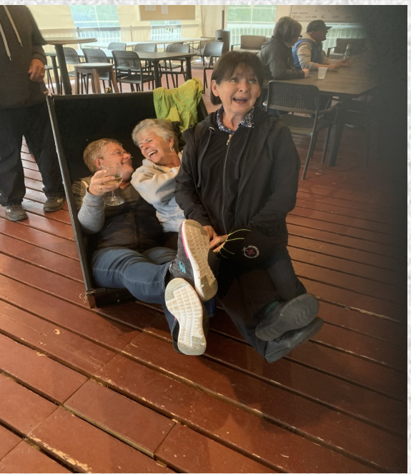
``What happens in Fort Nelson stays in Fort Nelson``

The most formidable highlight year after year, is the support from the oil & gas and business communities for all Petroleum Association events. Their participation is key to our success, and as always we are much appreciative of their continued involvement. Thank you sponsors!